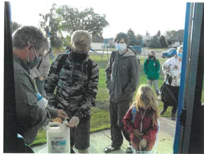
Masks on and hand washing prior to entry, We are more than ready for the 2021 school year.