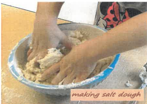
making salt dough