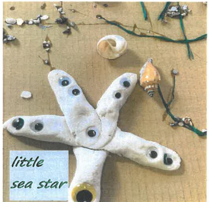
little sea star