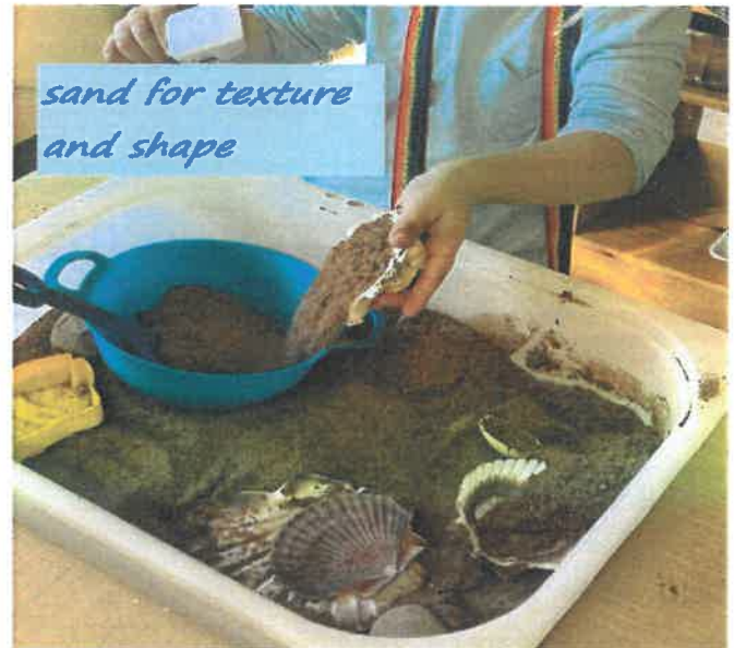
sand for texture and shape

September has been a month of using our senses and joyfully exploring ocean life. Children's hands have been hard at work with sorting many seashells, drama on top and under the ocean waves, and a variety of crafting creatures with different attributes; compared to our friends on land. We dove in and had a swimmingly good time!!