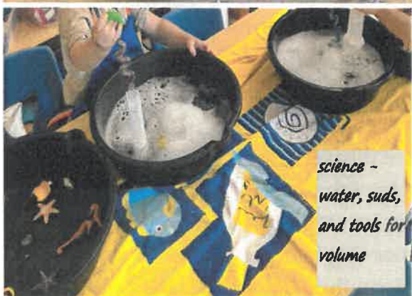
science - water, suds, and tools for volume