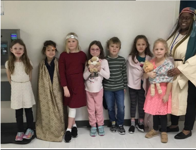
Gr 1-2 Bible Characters