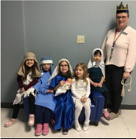
Kindergarten Bible Characters

The Connector Newsletter - Linking School to Home