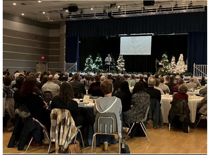
Banquet – A full house!